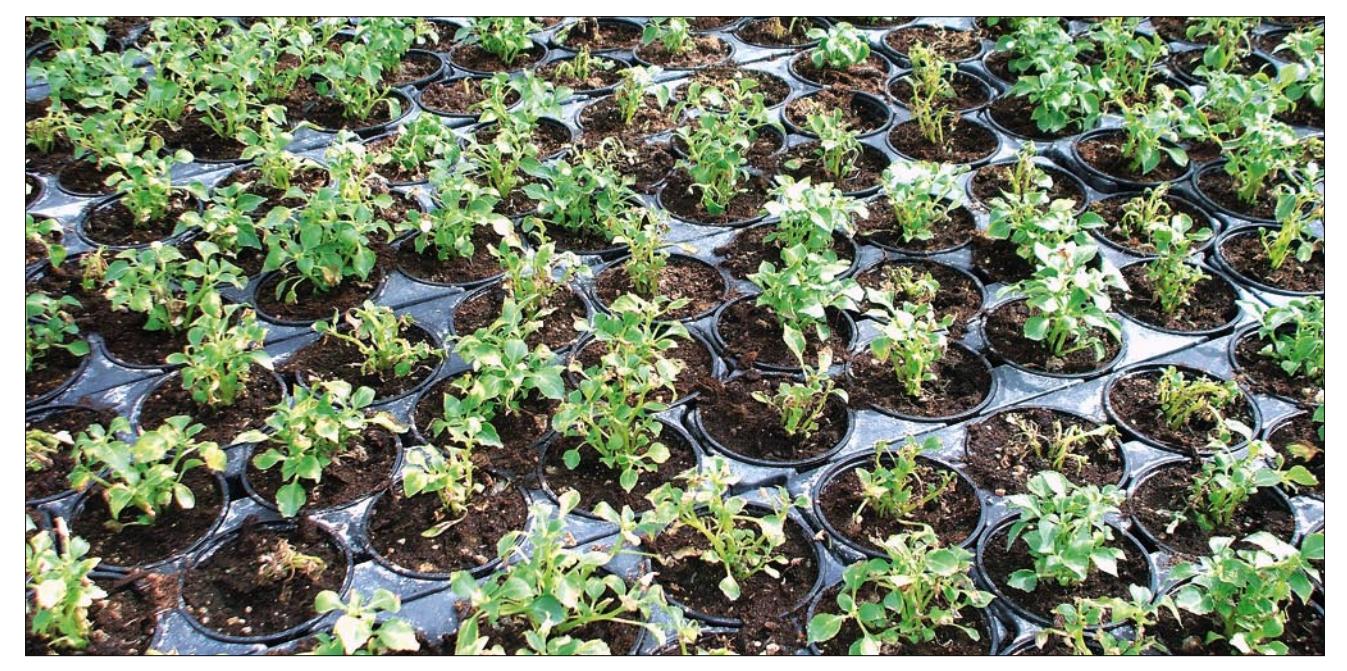
7 Extensive disease symptoms (including plant death) in a crop of pot grown impatiens

humidity levels and surface moisture which encourages disease development (Figure 7). A single diseased plant can potentially generate sufficient spores to infect hundreds of others in the confined space of a glasshouse.