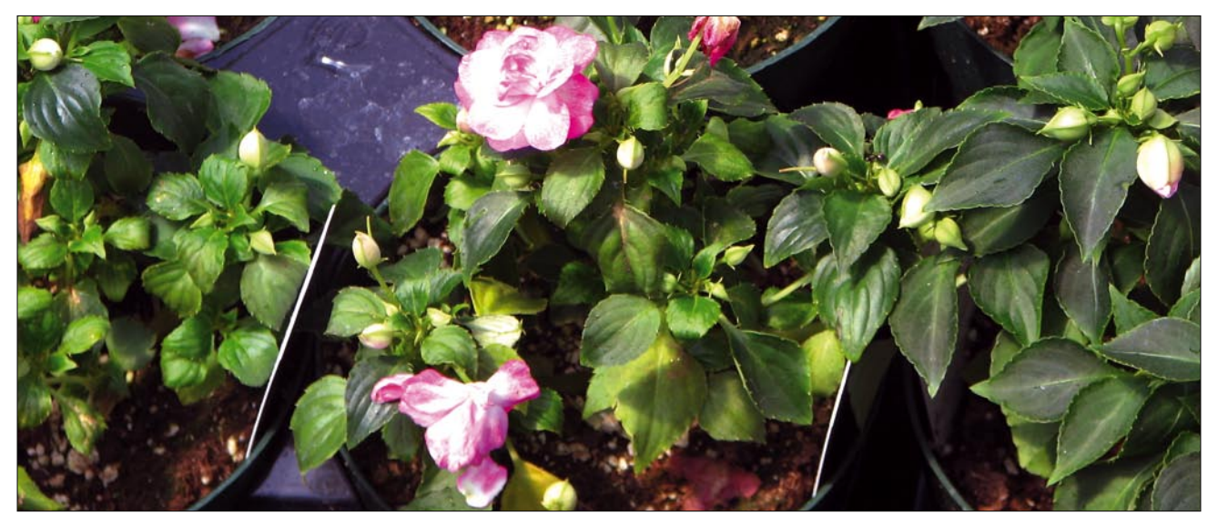
8 Early symptoms of leaf yellowing and stunting on a crop of impatiens

Impatiens crops have not previously required much in the way of fungicide applications but, given the recent increased prevalence and severity of the disease consideration should now be given to a routine preventative programme for downy mildew control. Regular early treatments with fungicides are advisable from the outset to minimise any risk from potential seed-borne infection and introduction via vegetative cuttings. The use of systemic products with good activity should be used where possible. Non-systemic protectant fungicides are also important in a programme of sprays to reduce the risk of resistance developing. Fungicides that have been used successfully to control downy mildew diseases of various crops and are permitted on protected and outdoor ornamentals (at growers own risk) are shown in Table 1.