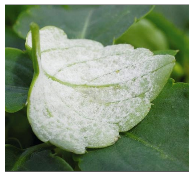
4 A dense, white layer of spores and spore-bearing structures of Plasmopara obducens on the lower surface of an impatiens leaf