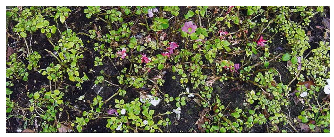
9 Impatiens plants in a floral display showing signs of severe infection