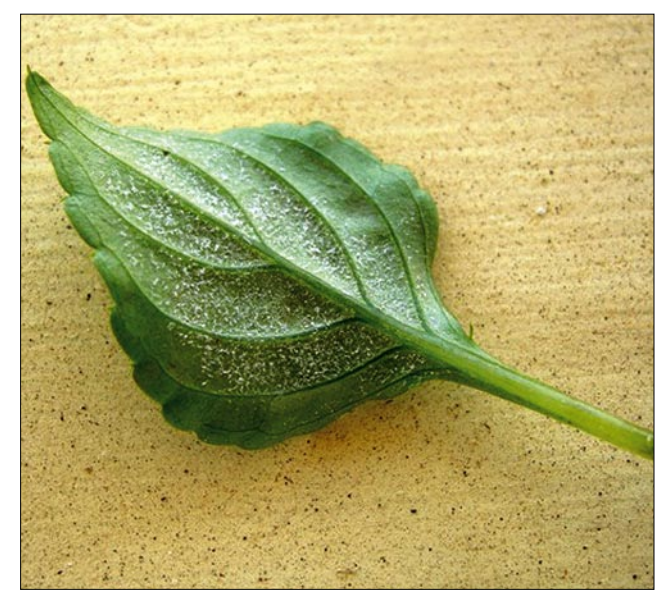
3 Diffuse, white, spores and spore-bearing structures of Plasmopara obducens on the lower surface of an impatiens leaf