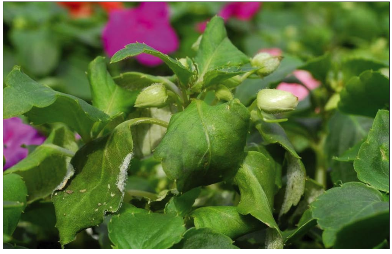
2 Early disease symptoms on impatiens - leaf paleness and curling

for the main veins (Figure 4). Usually as symptoms develop leaves fall prematurely from the plant leaving a series of unattractive bare stems, in some circumstances however leaf fall can occur with minimal levels of associated sporulation making disease identification difficult. Plants infected early are likely to be stunted and produce small, pale green or yellow leaves. Flowering is usually reduced or absent as a consequence of infection.