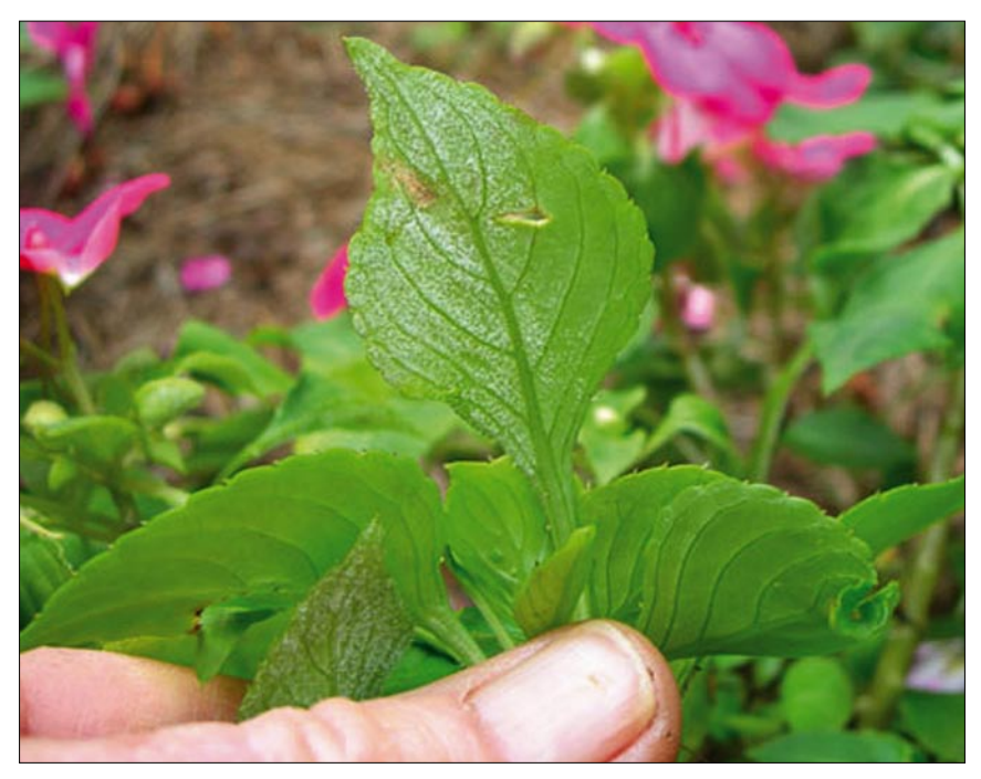
1 Sporulation on the lower leaf surface of impatiens identifies the problem as P. obducens